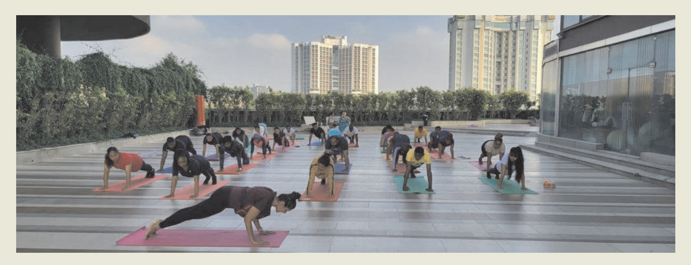
Diplomats from IOR countries participated in the Yoga Session