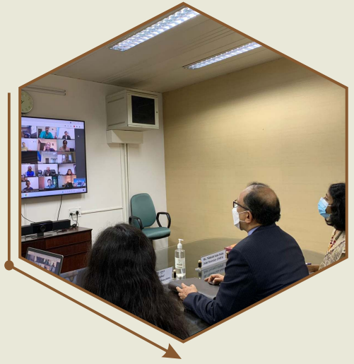
Promotion Related Training Programme for SOs/PSs virtually held from 12-23 July 2021