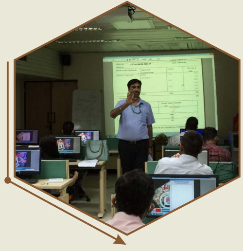
Participants of IMAS undergoing hands-on training in the Computer Lab of SSIFS