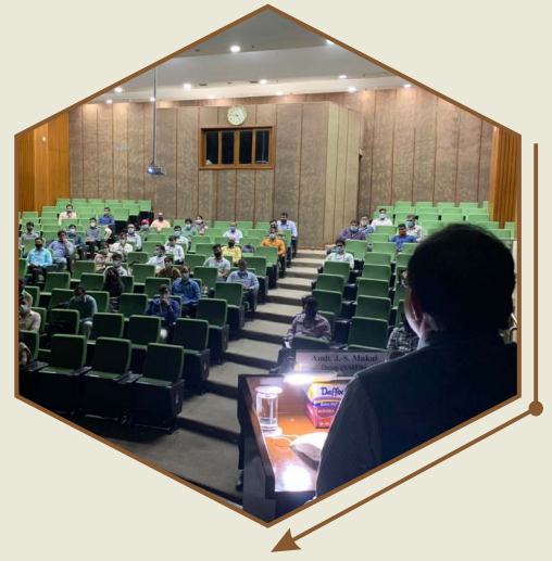
Dean (SSIFS) addressing the participants of Accounts Training Programme