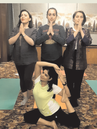
Yoga Session for Afghan Diplomats